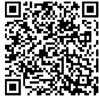
Scan to visit KKPS Enrolments online