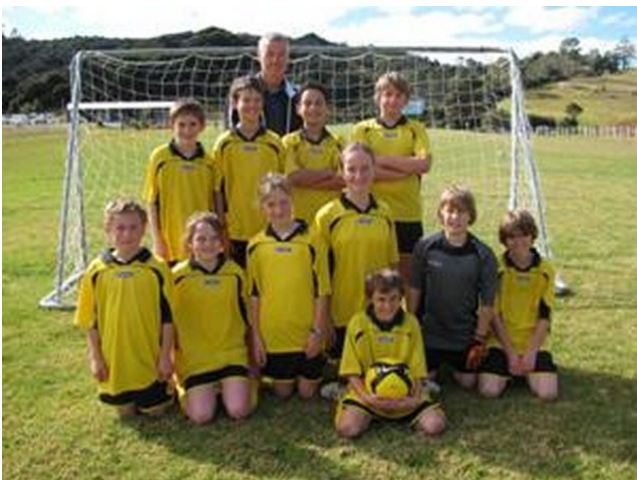
Kerikeri Lockwoods 12 th Grade winning team

Phone 407 8414 Fax 407 8429 School cell phone 021 124 2836